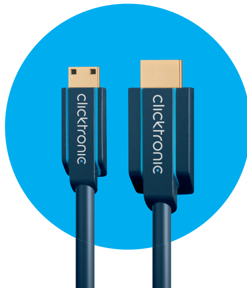
HDMI™ connector (type A) HDMI™ mini connector (type C)