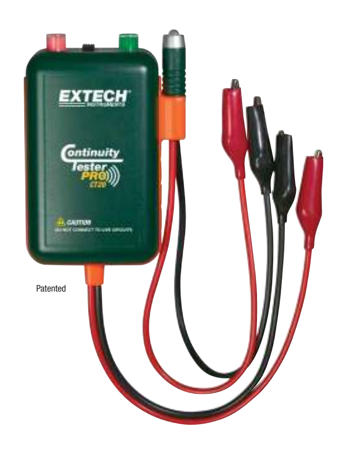
Continuity Tester includes Remote probe with bi-color LED for wire identification highlight