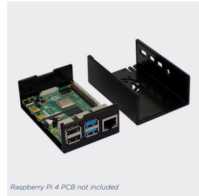
Raspberry Pi 4 PCB not included