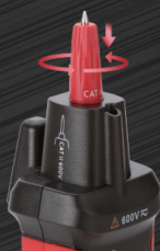
CAT III 600V