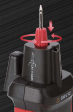
CAT II 600V