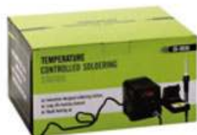
color box package